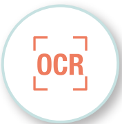
Optical Character Recognition

Higher Duty Cycles and Periodic Maintenance Intervals provide greater volume with fewer routine service calls so you can stay focused on productivity.