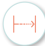
Soft Close Drawers